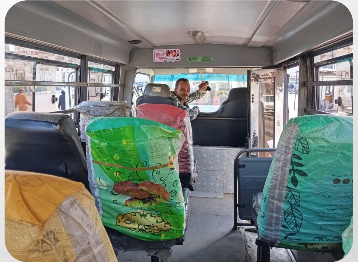
PHOTO FROM MICROBUS AND MINIBUS